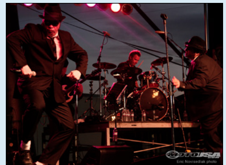
BB_W&K_Photo4.jpg / 1.1mbs