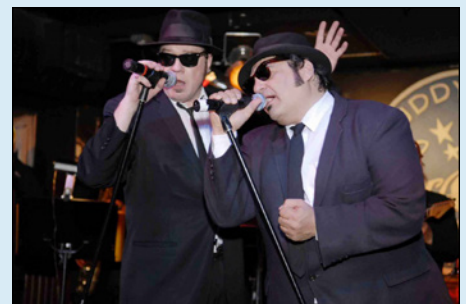
BB_W&K_Photo5.jpg / 423kbs