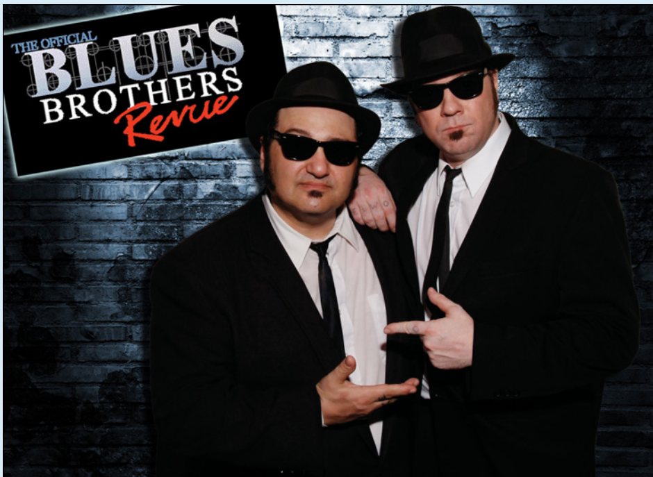
BB_W&K_Photo1.jpg / 9.6mbs