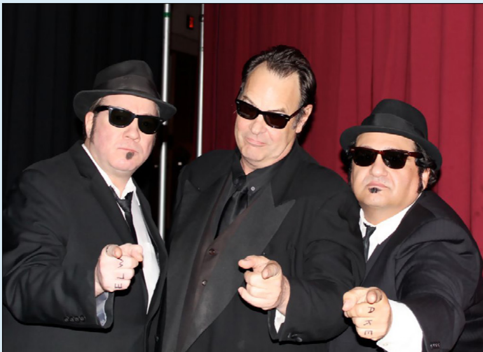
BB_WK&Dan_Photo7.jpg / 223kbs