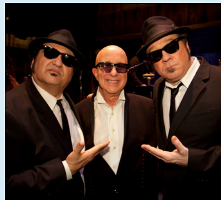
BB_WK&Paul_Photo8.jpg / 5.7mbs