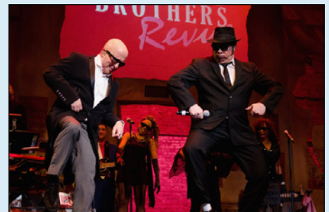
BB_W&Paul_Photo6.jpg / 153kbs