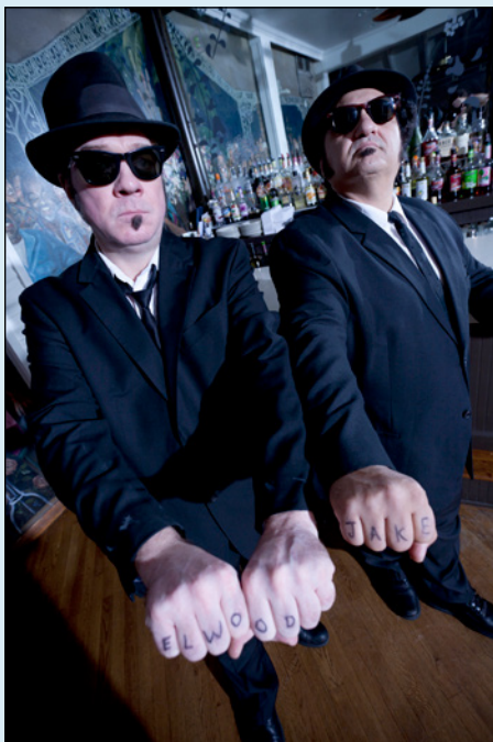
BB_W&K_Photo2.jpg / 3.8mbs