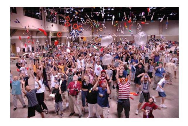
At an IJA Juggling Convention there's always a "Big Toss-up" in which everyone at the event throws an armload of props into the air. (Generally, nothing is actually juggled in a Big Toss-up. It just makes a great picture.

There are now juggling clubs, conventions and competitions around the world. As the basics of juggling are more widely known and practiced today by amateurs, professional entertainers have been spurred to push the practice to greater heights. As a result, troupes such as the Flying Karamazov Brothers have emerged as masters of the art, performing feats never before imagined possible.