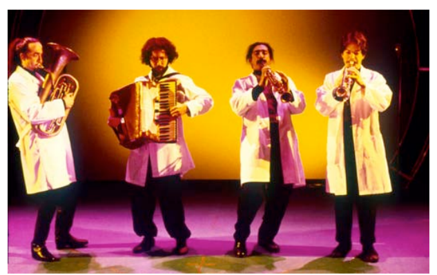
A bit from the show, "L'Universe"