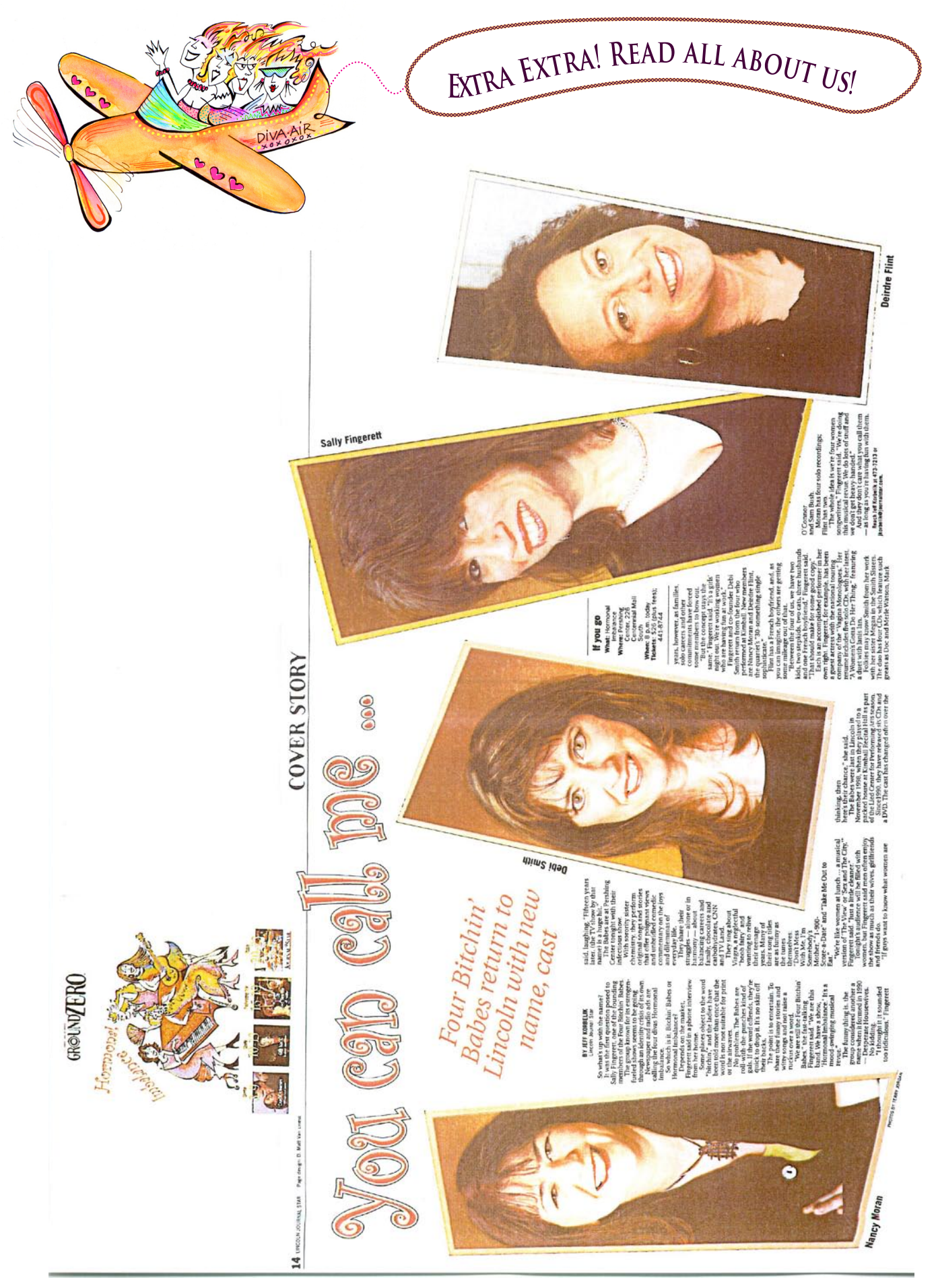
Babesland...Where music, laughter & girlfriends reign!