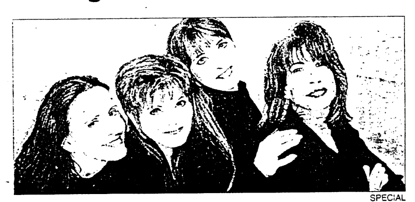
The Four Bitchin' Babes write funny, sophisticated songs.

"As far as the music goes, what's fun is that we do live in four different cities, so we bring the independence of our separate