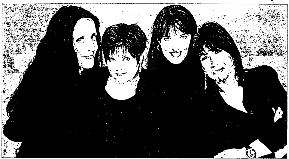
Harmonies, humor and plenty of attitude will fill the Jim Rouse Theatre in Columbia when the Four Bitchin' Babes arrive and hit the stage.

The original member of the Four 2.28. The Catonsylle Times June 16, 200-